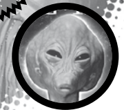
World Building Master Class!

*All guests confirmed commitments pending. Images copyright their respective owners.