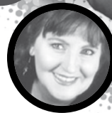
Jennifer Fallon: Writer of The Tide Lords series!

FREE! entry for kids 12 and under! *free entry only with accompanying paying adult.