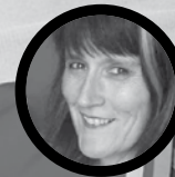
Marianne de Pierres: Writer of the Parrish Plessis series!